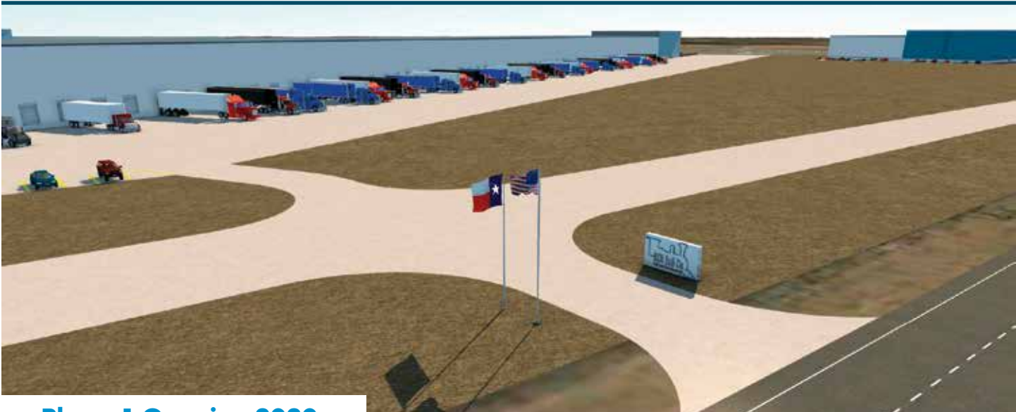
Phase 1 Opening 2020

Economic Growth Since 2008, 20 new companies bringing 300 new jobs and investing $40M into local economy